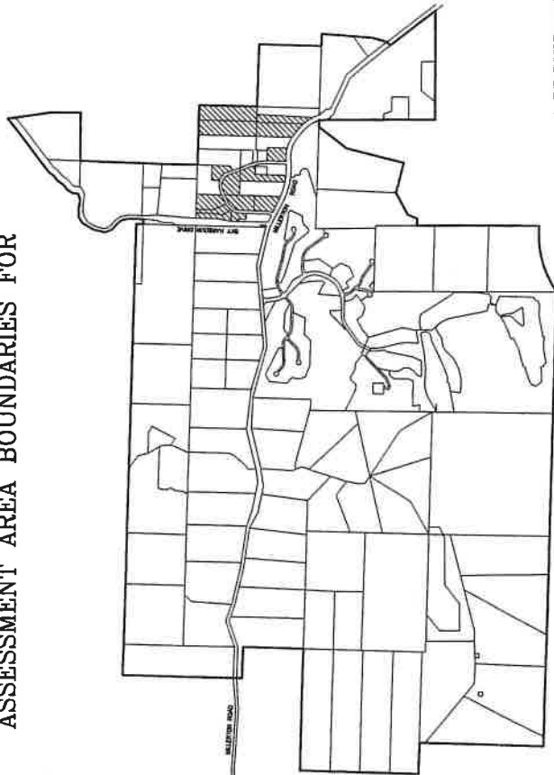
AMENDMENT NO. 1 AREA ADDED TO ORIGINAL ASSESSMENT AREA